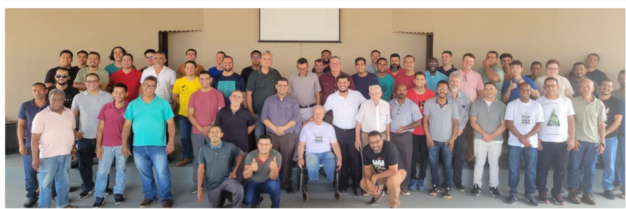
Men's Retreat August.