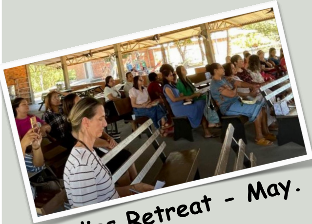
Ladies Retreat - May.