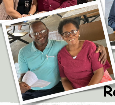
Couple's Retreat - June.