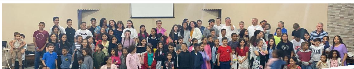
Kid's Camp - July.