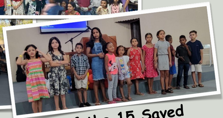
12 of the 15 Saved