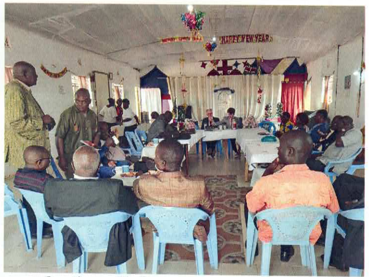
Our time with Pastors in western Kenya