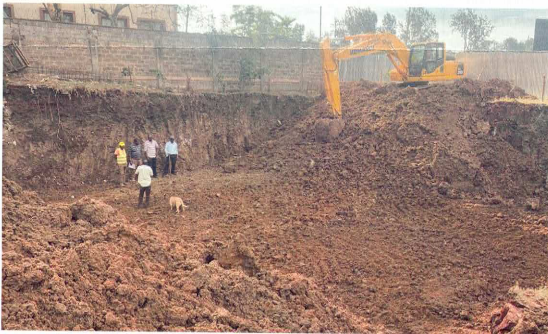
Excavation for new church facilities