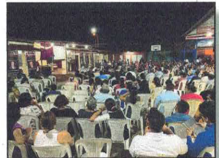
Conference attendees at night